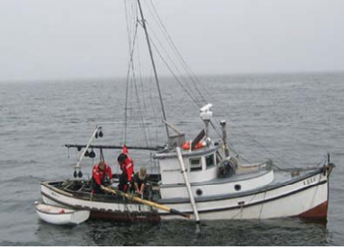
Fishing Vessel Leif; July 6, 2005.